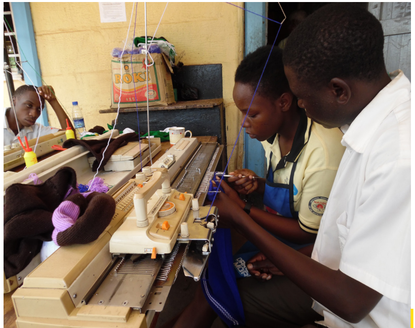
A support assistant helps a learner with deaf blindness during a knitting session

Learners with deaf blindness require one-on-one attention in order to properly grasp modules taught to them. Classmates, usually deaf learners, are brought in as support assistants. This not only aids classmates to learn how to communicate with persons with deaf blindness but also encourages peer support and accelerated learning.